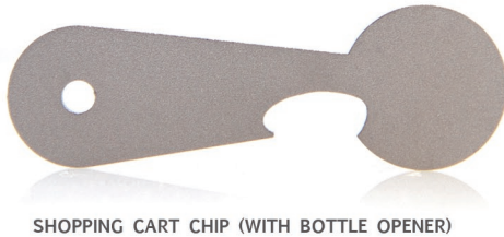
SHOPPING CART CHIP (WITH BOTTLE OPENER)